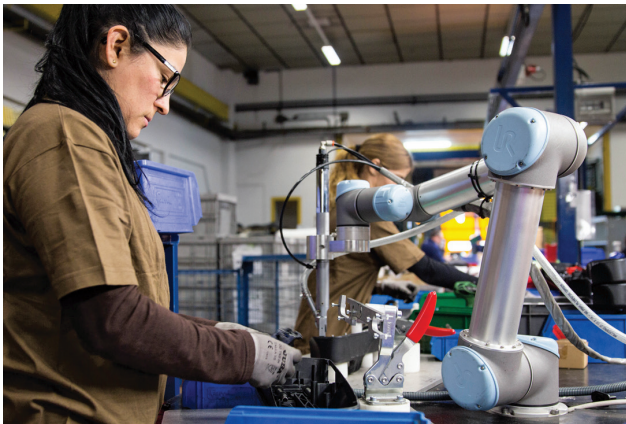
Collaborative robots work safely next to people.